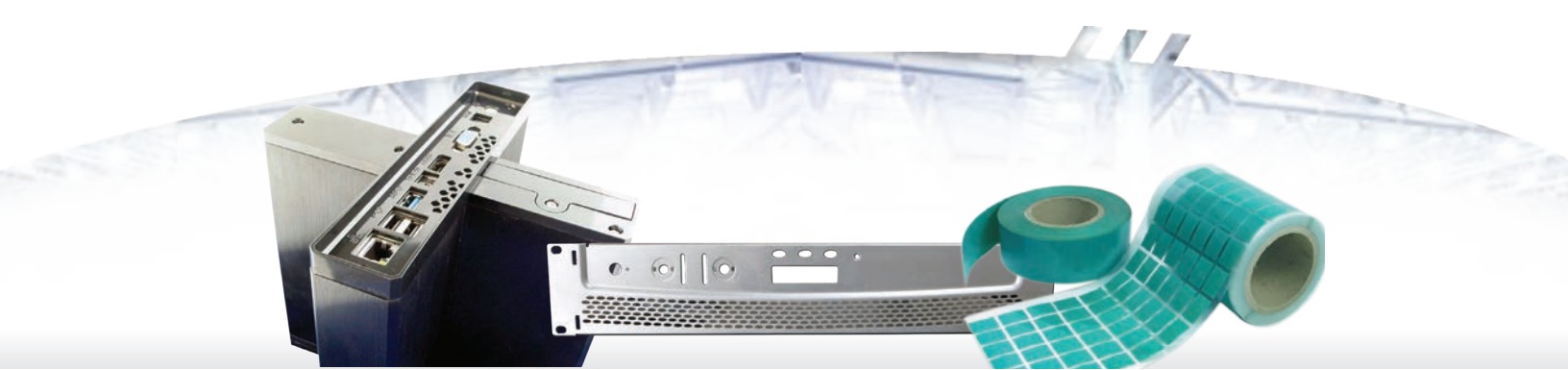
Product examples (from left to right): Encloser, Front Panel, Hi-Flow 300G