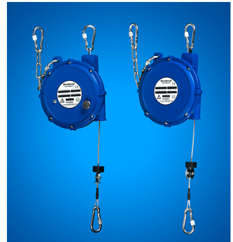
1 to 11 Pound Balancers Left: Enhanced Balancer with Ratchet Lock Right: Standard Balancer

130237 0.5 to 5.0kg (1 to 11 lb) Weight Range