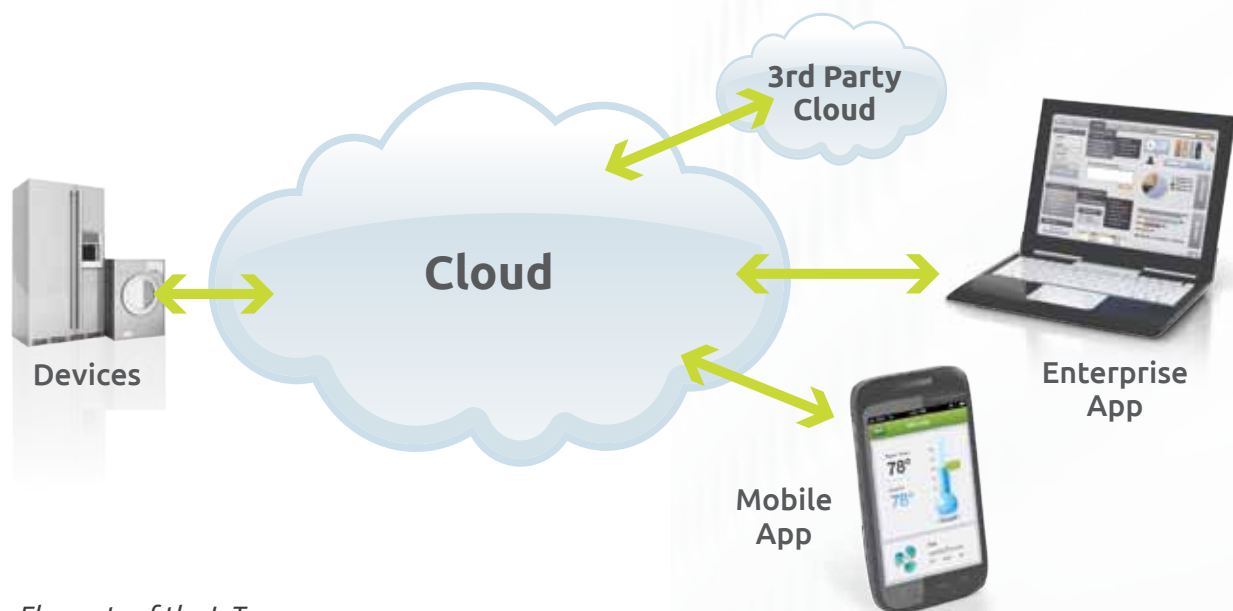
Key Elements of the IoT

In fact, we don't think anyone has a clear idea yet. This is an entirely new market, and if the history of technology is any guide, consumers and even business buyers will behave in unpredictable ways. Digital Equipment CEO Ken Olsen didn't think anyone would ever want a computer in their home.