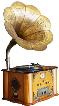
1877: Thomas Edison invents the phonograph