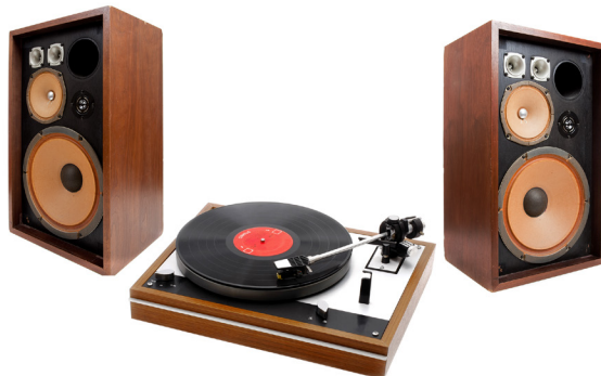
1950s: Stereophonic-sound technology arrives, allowing music to “surround” the listener