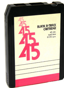
1964: 8-Track tape invented, making music mobile