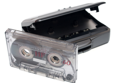
1979: Sony® Walkman™ introduced, cassette tapes become more popular than LPs