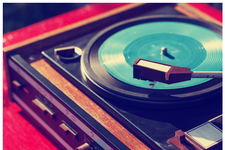
Stereophonic sound allowed the use of two or more channels of transmission and created a listening experience that was closer to a live music performance or soundstage.

The audio engineers’ combination of passion and their ability to discover new, creative listening technologies dovetailed with the demands of a new class of listeners—commonly called “audiophiles”—who were determined to experience music in its purest form, absorb every chord and vocal subtlety. As such, a partnership was created between these two groups, the audio engineer reliably advancing listening technology and the audiophile ready to purchase it in the ongoing journey to hear music the way it was meant to sound.