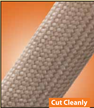
Cut Cleanly Scissors