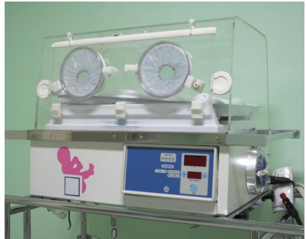
Figure 5. Incubators/Microenvironments

May be used to provide optimal temperature and RH levels to support critical processes and experiments, enhancing process efficiency with desired climate conditions.