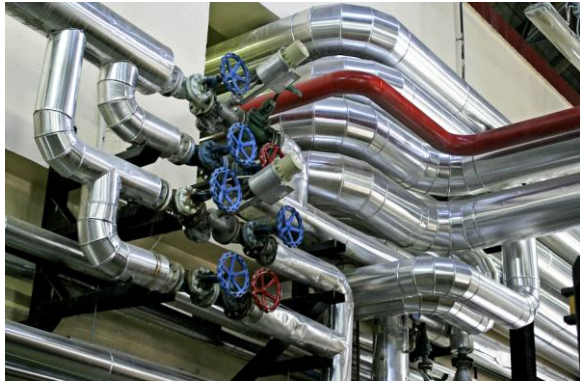
Figure 3. HVAC/R

May be used to provide precision RH and temperature measurement in air conditioning/air movement systems, enthalpy sensing, thermostats, humidifiers/de-humidifiers, and humidistats to maintain occupant comfort and ideal storage humidity/temperature while achieving low energy consumption, supporting system accuracy and warranty requirements, maximizing system uptime, and improving overall system quality.