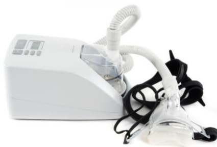
Figure 4. Respiratory Therapy (Sleep Apnea Machines, Ventilators)

May be used to provide precision RH and temperature measurement in air conditioning/air movement systems, enthalpy sensing, thermostats, humidifiers/de-humidifiers, and humidistats to maintain occupant comfort and ideal storage humidity/temperature while achieving low energy consumption, supporting system accuracy and warranty requirements, maximizing system uptime, and improving overall system quality.