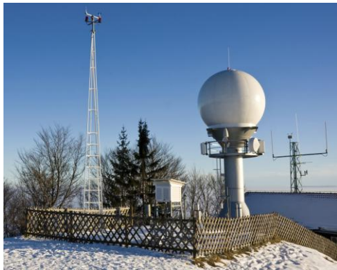
Figure 7. Weather Stations

May be used to provide precision RH and temperature measurement in ground-based and air-borne weather stations, allowing real time and highly accurate monitoring and reporting of actual weather conditions.