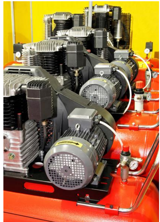
Figure 6. Air Compressors

May be used to provide precision RH measurement in compressed air lines, allowing the system to remove any condensation; dry compressed air is critical for customer process control measurement.