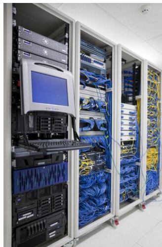
Figure 8. Telecom Cabinets

May be used to provide precision RH and temperature measurement in the telecom cabinet HVAC system; maintaining proper temperature and humidity levels in the cabinet provides maximum system uptime and performance.