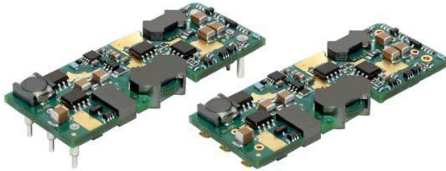
Figure 2 - DC to DC type converter

Airflow for a U channel supply would never be blown across the U channel. However many Dc to Dc converters, like the one in Figure 2, will require forced airflow across the converter and not from input to output. Always check the specification for the specified amount of airflow needed and the direction of the airflow.