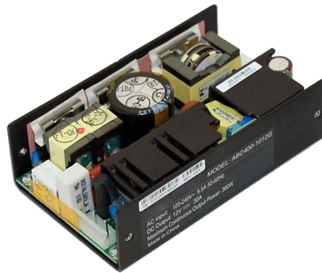
Figure 1. U Channel Type Power Supply

Many AC-DC power supplies and DC-DC converters have output power ratings that can vary significantly depending on the type of cooling provided. The two most common methods of cooling a power supply are Convection cooled and Forced air cooling. “Convection air cooling” usually refers to situations where a power supply or converter is cooled by the prevailing ambient air temperature, next to the power supply, without forced-air-flow from fans or blowers. The supply may also be cooled by a fan mounted in or on the AC supply or be cooled by a system fan. Many times the power supply specification has two output power ratings, the “convection cooled” (still-air) power rating will be less than the “forced-air cooling” rating.