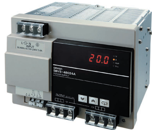
NEW 480 W models provide 20 Amps in a compact package