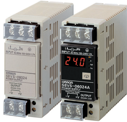
Compact plastic enclosure 60 W models