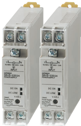
Super slim 15 & 30 W models