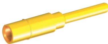
SUBMINIATURE SOCKET CONTACT