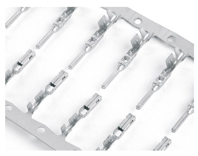
APEX® 1.5 Female & Male Terminals