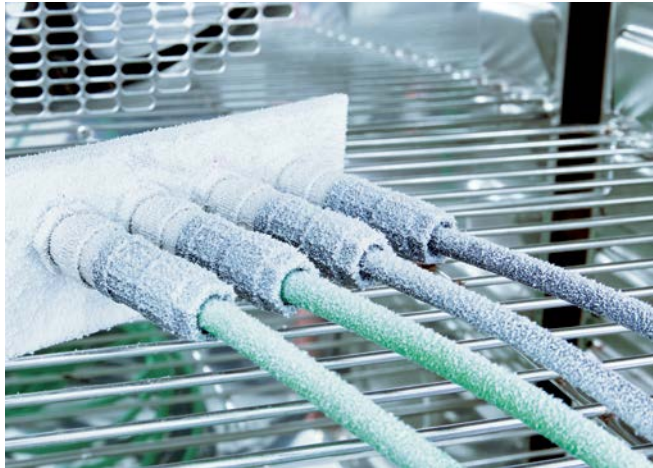
Figure 3: Temperature cyclic test – preassembled M12 Optic test cables demonstrate their suitability for use in industrial applications during the cold phase.

In contrast to conventional optical rectangular connectors, the M12 Optic offers a number of advantages: thanks to its smaller design-in outline, the M12 design is also suitable for compact devices. The screw connector, which is already in use worldwide, also enables a stable connection between the device and the field cabling under mechanical load. Thanks to its recessed ferrules, the fiber ends of the M12 Optic can also be protected against damage during handling. Another advantage of optical M12 connectors is that they fulfill the requirements of protection class IP65/67, so they can protect against the ingress of dust and water.