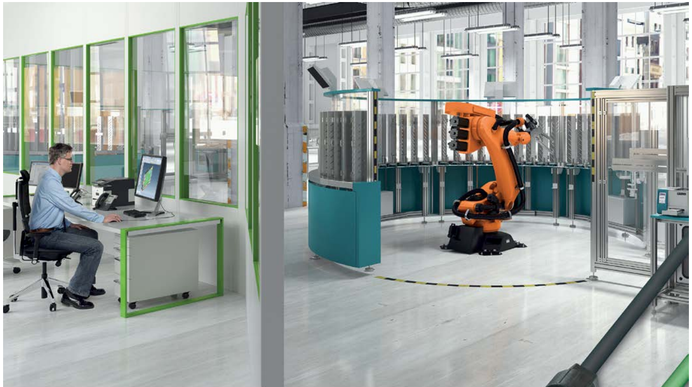
Figure 1: Fiber-optic data connectors for the smart production of tomorrow – the M12 Optic can be used in a vast range of applications, thanks to a wide variety of fiber types.