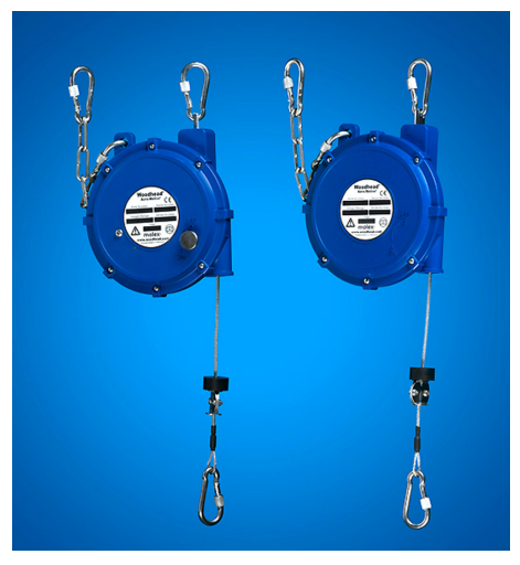
1 to 11 Pound Balancers Left: Enhanced Balancer with Ratchet Lock Right: Standard Balancer

130237 0.5 to 5.0kg (1 to 11 lb) Weight Range