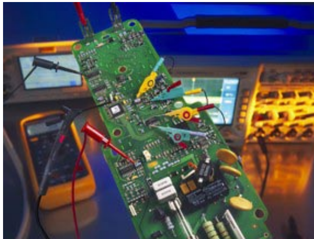
Minigrabbers and micrograbbers connect quickly to component test leads, terminals and integrated circuit leads. (Pomona models 5520, 5360, 4826)

"We often have to do that in the course of engineering prototypes and working through the software development process. The software and the hardware go through an iterative process and a synergistic iterative process where we build the hardware then they write some software to work on it. Then they find out 'Well, if you did the hardware a little differently it would work better and the