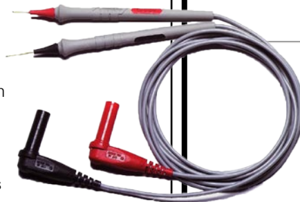
Precision electronic probes with gold pogo pin tips provide reliable contacts without damaging delicate solder joints. (Pomona model 6341)

"We're always conducting some tests. Mostly we're looking at software behavior, but we're looking at it at the physical level, so we need to physically probe the device."