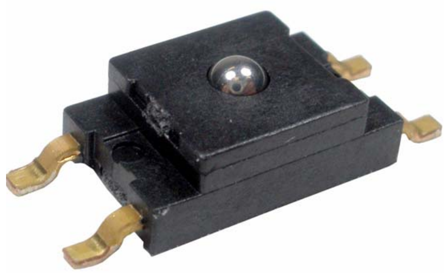
FSS-SMT , enlarged