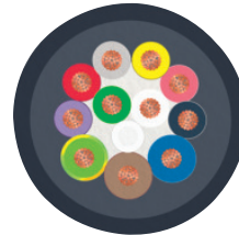
PUR/PVC black [PUR]