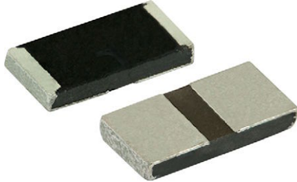
Aluminum nitride over 3 x more power - same size