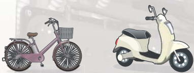
E-assist bicycle Electric bicycle