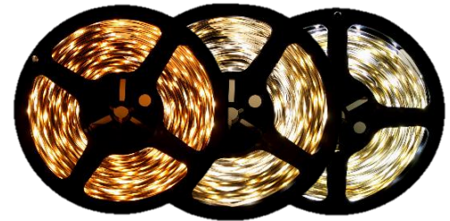
Warm White 3000K Pure White 4200K Cool White 6000K

Inspired LED Flexible Strip Lights are a simple, customizable solution for all of your LED lighting needs. These unique strips can be cut to length and terminated with solderless end connectors for easy DIY installation. Energy efficient, with a wide range of options for brightness and color, LED Flex Strips are the perfect option for any lighting application.