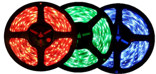
Red Green Blue Available in NB & SB Only NB, SB & UB Only