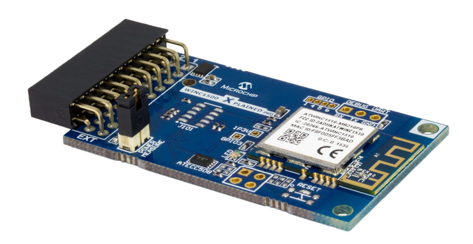
Figure 1. WINC1500 Xplained Pro Extension Board

The WINC1500-XPRO is an extension board to evaluate the performance of the ATWINC15x0-MR210xB IoT (Internet of Things) module that supports an IEEE<sup>®</sup> 802.11 b/g/n standard. The WINC1500 Xplained Pro extension board is designed to provide Wi-Fi<sup>®</sup> functionality in the 2.4 GHz ISM band to the Xplained Pro evaluation platform. This kit provides access to the features of the ATWINC15x0-MR210xB wireless module and explains how to integrate the module in a custom design.