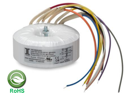
<sup>/EU</sup> Photo for illustration only

460 Harley Knox Blvd. Perris, California 92571