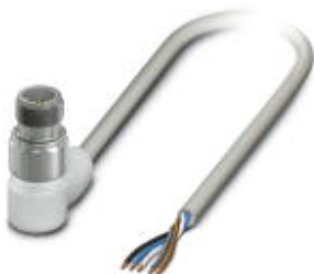
Sensor/Actuator cable, 5-position, PP-EPDM halogen-free, Gray RAL 7035, Plug angled M12, A-coded, on Free cable end, Cable length: 10 m, Hygienic design, With high-grade steel knurl

Please be informed that the data shown in this PDF Document is generated from our Online Catalog. Please find the complete data in the user's documentation. Our General Terms of Use for Downloads are valid ( http://download.phoenixcontact.com )