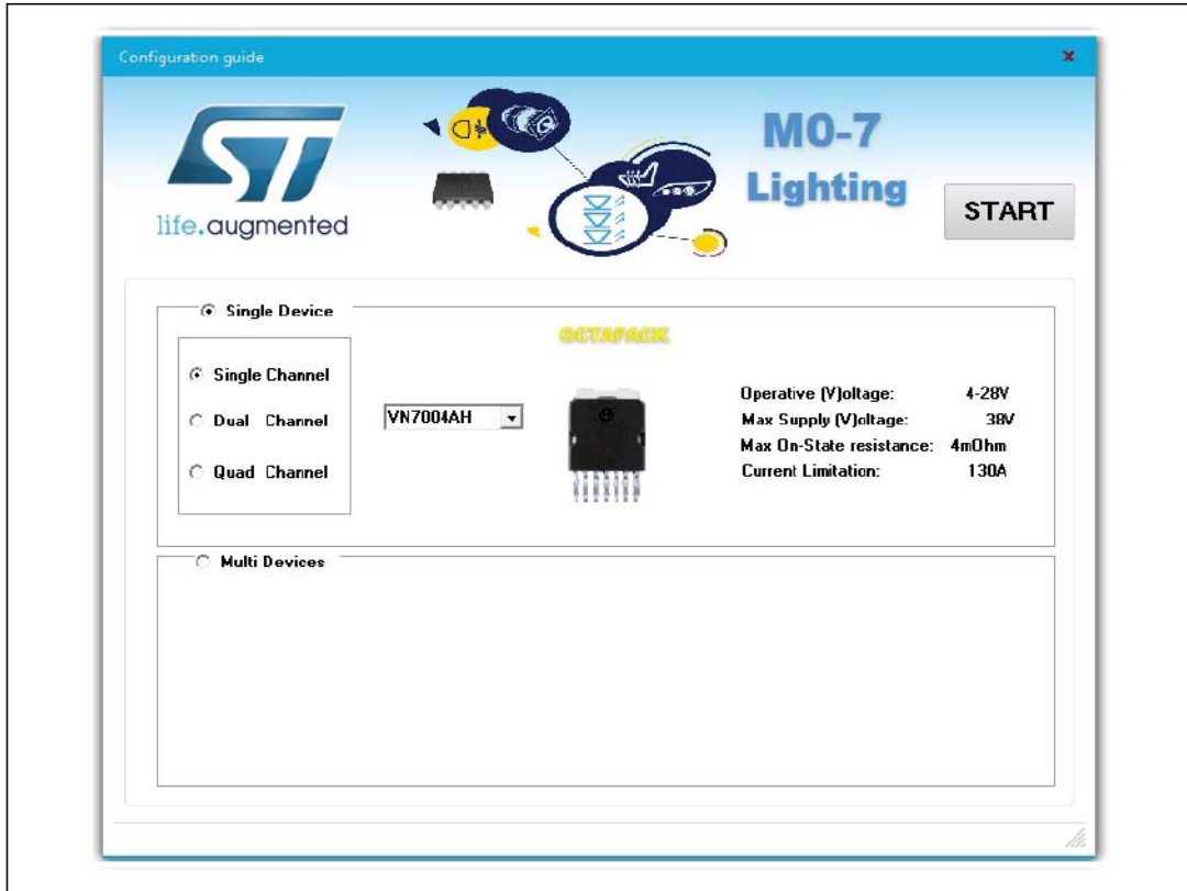
Figure 2. Gui interface

GUI is available to control the entire system, that is to say SPC560B-DIS Discovery board connected with the VIP-M07-ADIS application board. For more information, and download of the latest version available, please refer to ST web www.st.com .