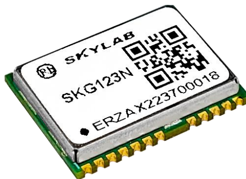
图 1: SKG123N 正视图/Top view

SKG123N is a high-performance vehicle integrated navigation module for the field of vehicle navigation. The module can simultaneously support GPS, BDS, GLONASS, Galileo and QZSS satellite positioning systems, and support L1+L5 dual frequency positioning.