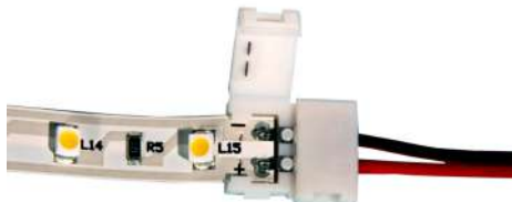
ZFS-CH140-I connector with LED flex