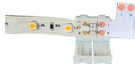
ZFS-CH0-8J & ZFS-CNL-8J connectors with LED flex